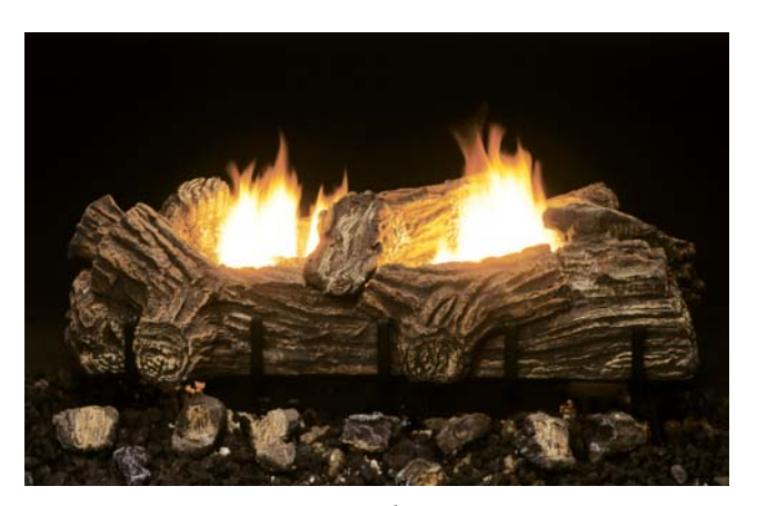
DST Vent Free Gas Logs - Side A